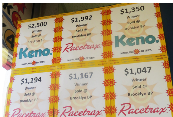
Signs promote big winning tickets.