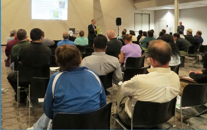
At the Montgomery Park session in Baltimore, retailers received an overview on upcoming products and initiatives.

More than 250 retailers and their associates attended one of 14 fall Regional Advisory Board meetings scheduled over a three-week period. Sessions took place twice daily at seven locations and included an informal, hands-on equipment and product demo on MONOPOLY MILLIONAIRES CLUB terminal tickets and merchandising suggestions for families of scratch-offs.