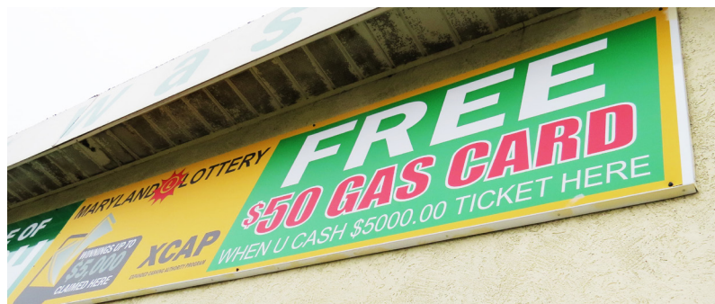
Exterior signage encourages Lottery transactions.