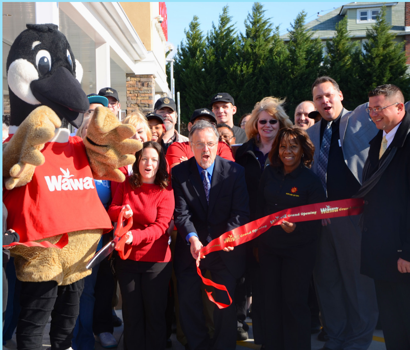
Lottery staff joined the Wawa corporate team and store employees at a grand opening of the Halethorpe store.

Wawa Inc. in mid-December completed an initiative to add Maryland Lottery scratch-offs and draw games to its product lineup. The company began adding Lottery products in September to 47 stores across the state. This new corporate partnership placed a self-service vending machine in each 24-hour store to give players access to Lottery games.